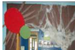
While Charlotte appeared on their door!