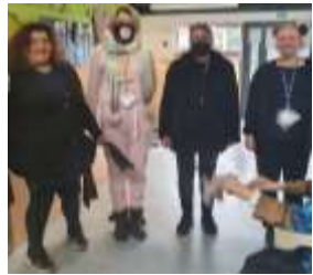
Characters from 'Charlotte's Web' in Lime Class.....

Silver Class travelled through the wardrobe to visit Narnia!