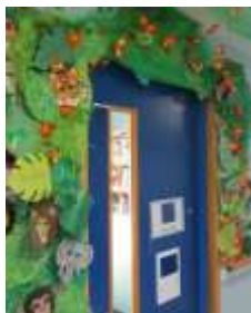
Blue Class created a jungle themed entrance