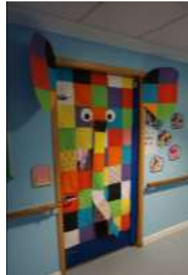
Pink Class had an 'Elmer' themed day while Red Class went on a bear hunt!.